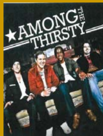
Among The Thirsty, Wonder Tour 2010